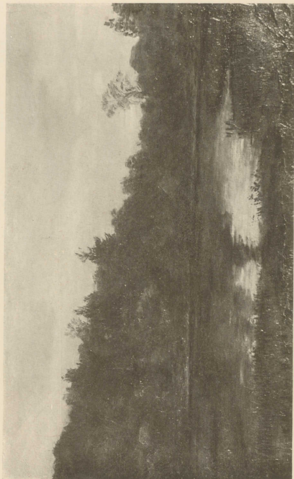
An Adirondack Lake