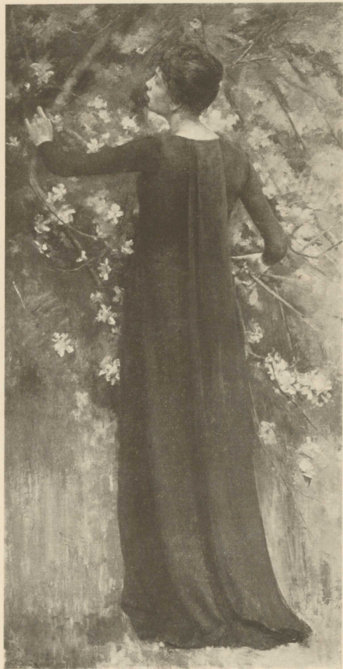
The Red Gown