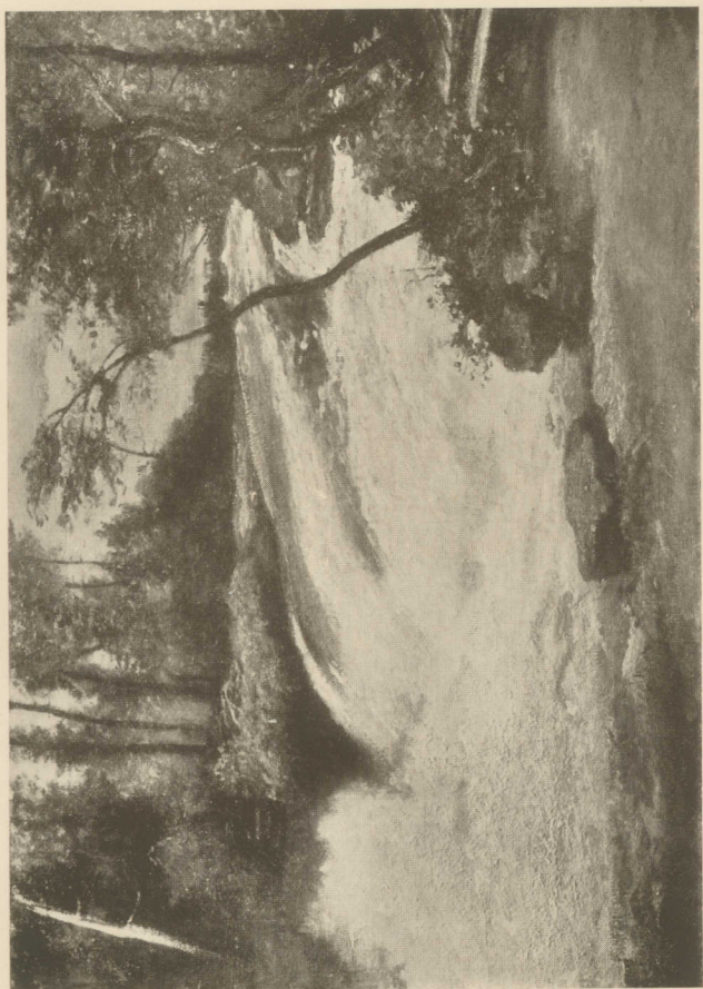
Rapids, Sister Islands, Niagara