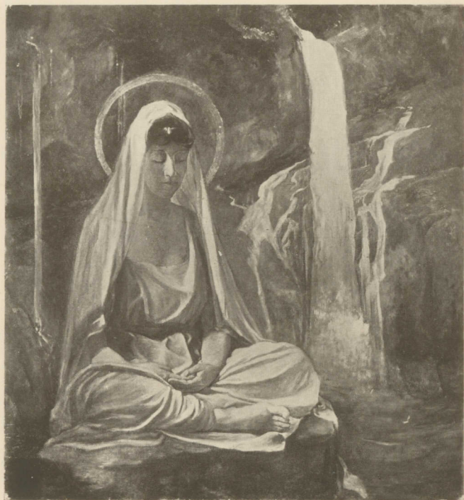
Kwaunon Meditating on Human Life