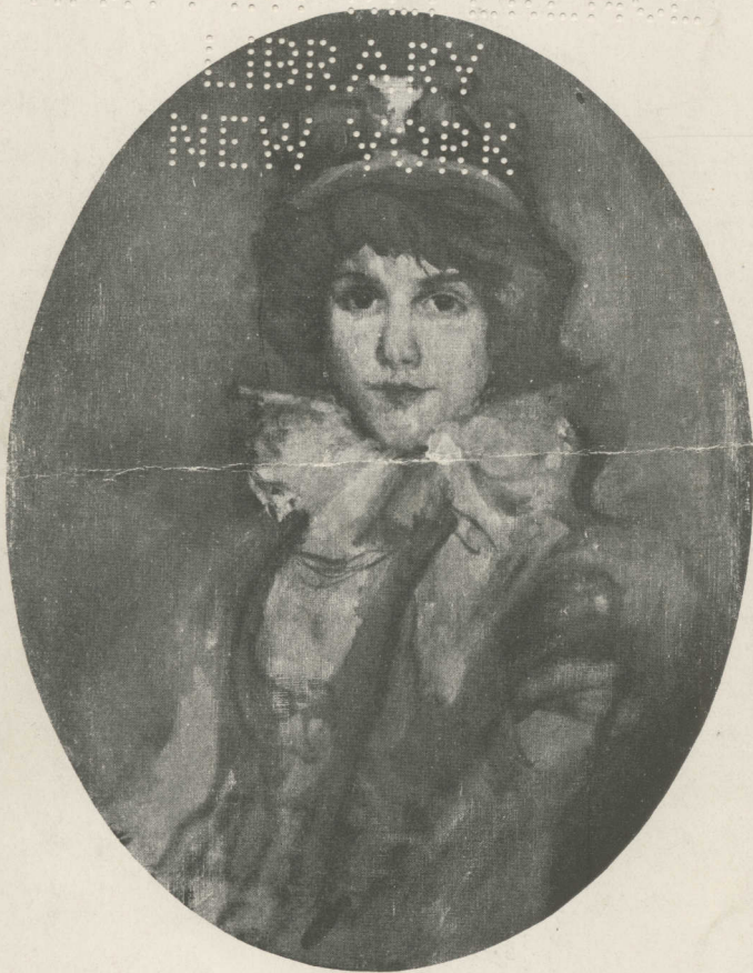
THE BLUE BONNET J. McN. WHISTLER