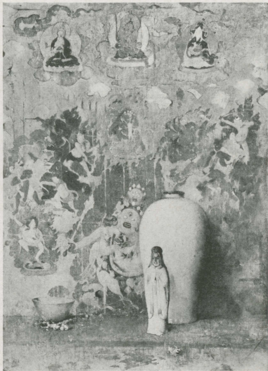
THE PICTURE FROM THIBET