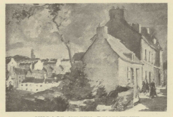
VILLAGE STREET, DUARNENEZ