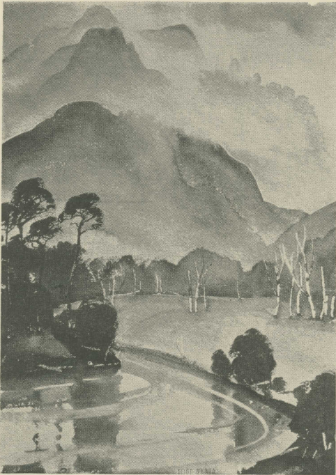
Rio Frias in the Andes