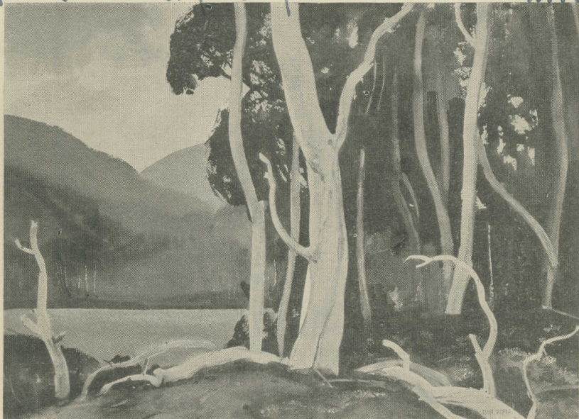
Dead Forest, Correntoso