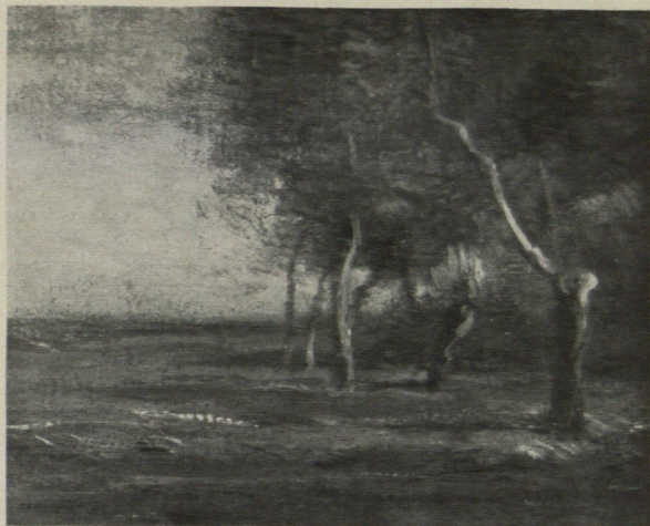
OCTOBER AFTERNOON, 1917