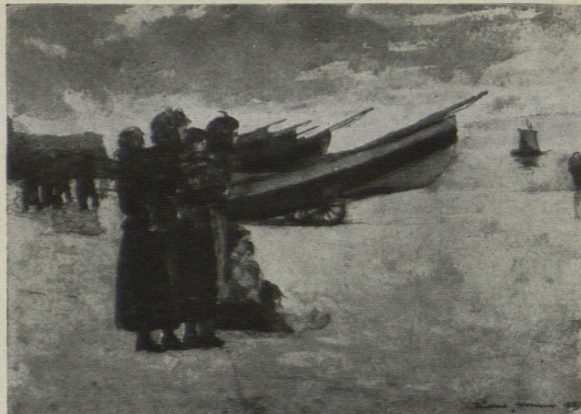
ON THE BEACH