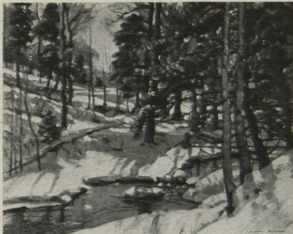
LATE AFTERNOON LIGHT