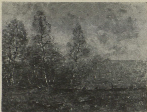
GRAY AUTUMN DAY