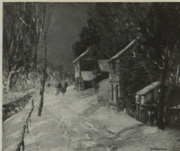
ROAD IN WINTER