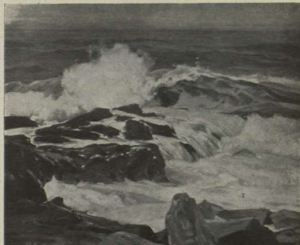
THE POINT OF THE REEF