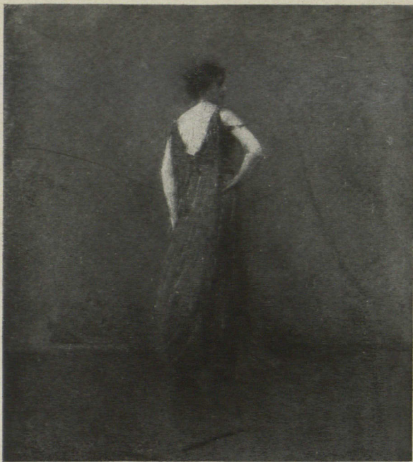
GREEN AND GOLD