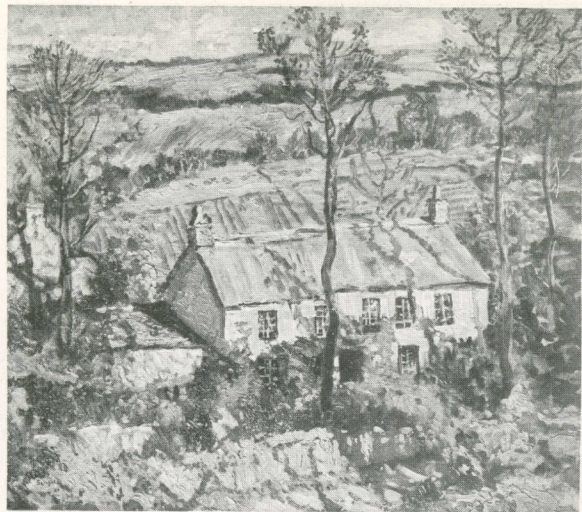
HARMONY COT W. ELMER SCHOFIELD, N. A.