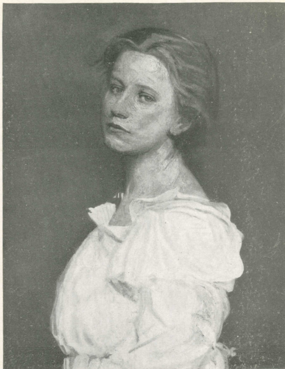
YOUNG WOMAN IN WHITE ABBOTT H. THAYER