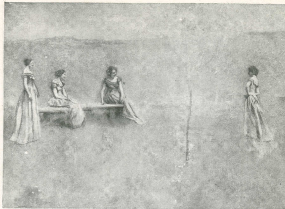
LA PECHE T. W. DEWING