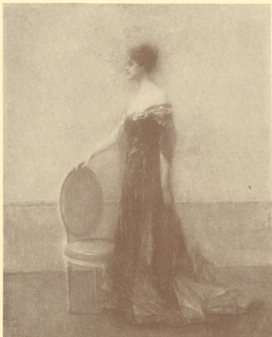
THOMAS W. DEWING