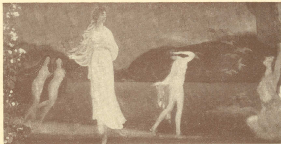
ARTHUR B. DAVIES

Whether this will work to the benefit of all concerned, remains to be seen, and we may have to revert to the old established custom. We are, however, resolved to try the new idea for at least one season, and we believe that it will meet with approval.